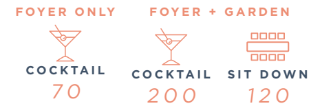
Images for display purposes only